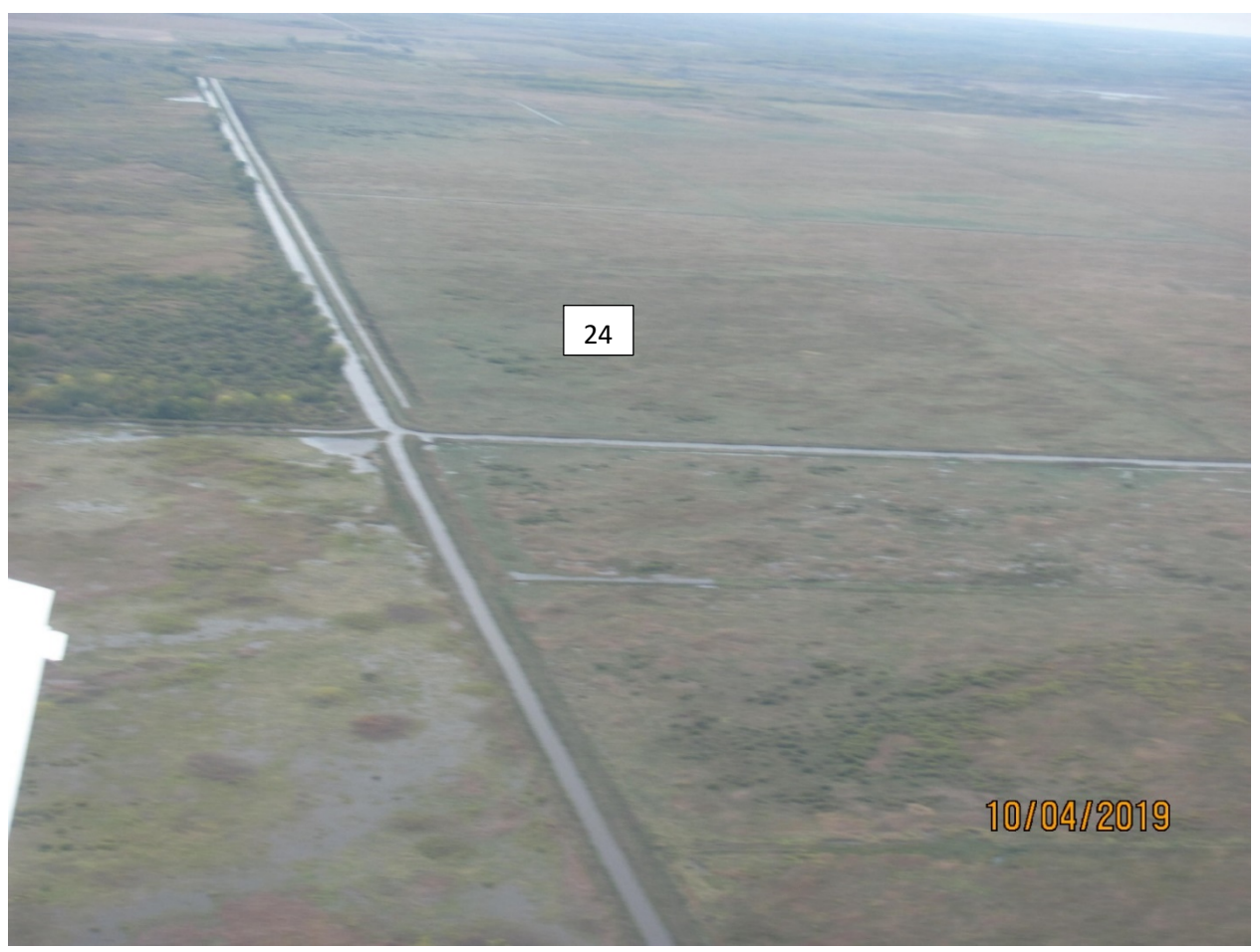
Roseau County in foreground; Lat1 Br4 SD95 - Kittson County in background; Lat1 SD95